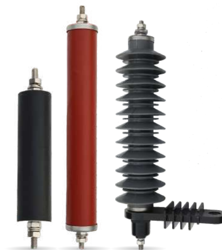
Table : 1

From the above, there are different criteria are required to meet these individual selection process, the highest resulting rating must be chosen.